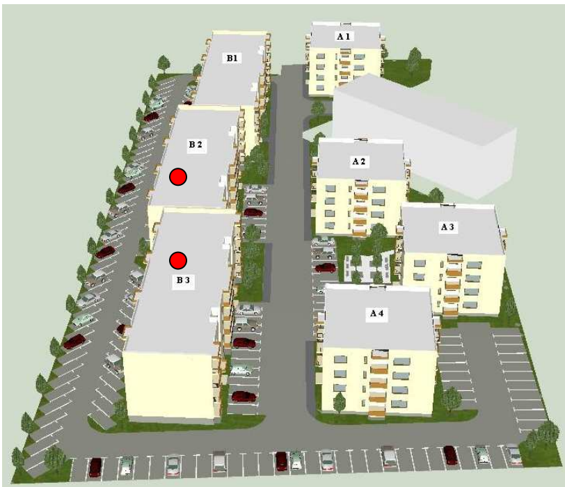
Position of the blocs of flats in "Dumbrava" Residential Housing