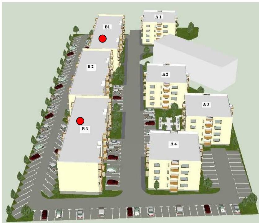
Poziționare imobile in Ansamblul Rezidential " Dumbrava"